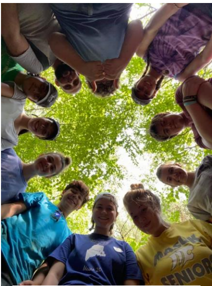
1 Crabtree Land Trust Work Team

"By this everyone will know that you are my disciples, if you love one another."—John 13:35