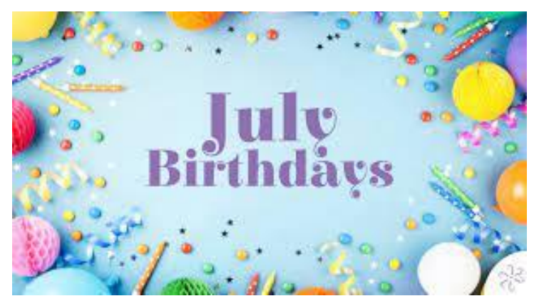
Happy July Birthday to the following people and to anyone we may have missed we will keep you in our prayers.