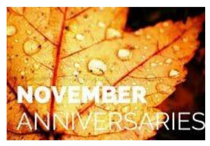
Happy November Wedding Anniversary the following couples and to anyone we may have missed, we will keep you in our prayers. (Number is anniversary date)