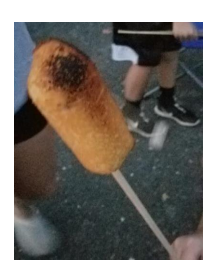
When S'mores weren't enough the Jr. PFers decided to roast some Twinkies!