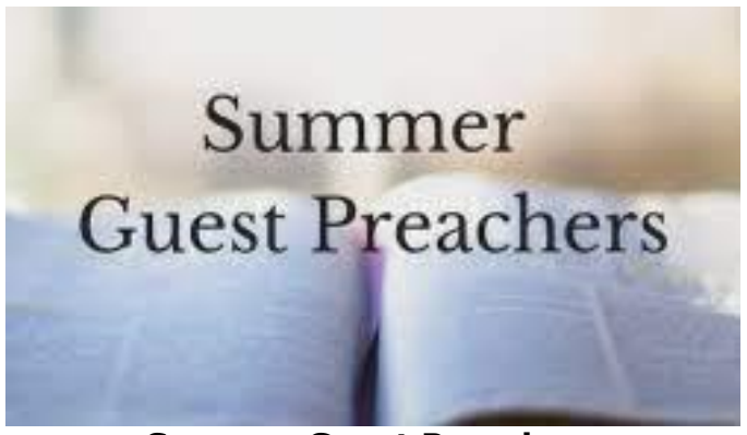
Summer Guest Preachers

https://www.signupgenius.com/go/10C0C48ADAC2CA5FEC61-flowers