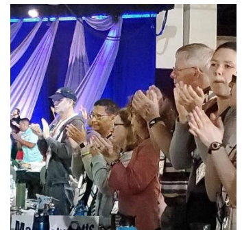
Delegates applaud passage of Together As One

The theme for the 32nd General Synod was based on the scripture Matthew 5:16 "In the same way let your light shine before others . . ." GS is always an extraordinary event in the life of the Church, delegates and visitors experienced dynamic workshops, generative plenary sessions, inspirational worship, engaging youth activities, special banquets, and luncheons. Delegates conducted the business of the denomination and set priorities for our ministries. Keynote speakers offered illumination and insight into challenges that face our congregations and communities.