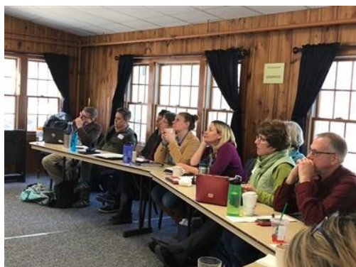
Members of the three conference staffs together on retreat in February. By Tiffany Vail, Associate Conference Minister of Communications

The staffs of the three Southern New England conferences will shift into a new, transitional structure for 2020, working together on teams aligned around their ministry and program areas rather than being separated by geography.