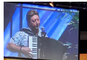
We even took the occasional polka break! When in Wisconsin...

Another very important resolution was passed, which you might already know about: Together As One, which is the work of bringing together the historically regional Massachusetts, Rhode Island and CT. This is an important next step in becoming a Southern New England Conference. The folks who work at the