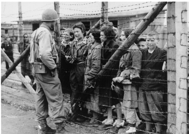
US soldier with liberated prisoners of the Mauthausen concentration camp. Austria, May 1945.

I had an opportunity to visit the Holocaust Museum in Washington, DC in preparation for my last sabbatical. I saw many displays that will live on in my memory for a very long time. One was the room full of shoes left behind by men, women and children who were led into the gas chambers. Another was an audio recording of soldiers who took part in the liberation of the concentration camps. They described what it was like to rescue such frail, emaciated people as they were nourished with a new hope of freedom.