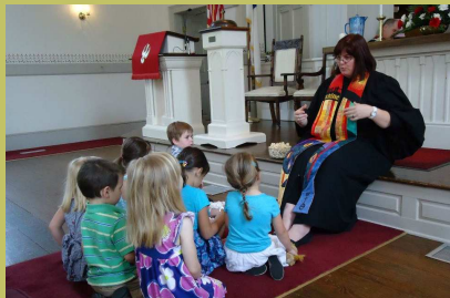
Welcoming the Children at MCC