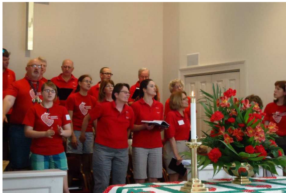
MCC's Adult Choir on Strawberry Festival Sunday

We are an open and affirming, covenantal church community who embraces the idea that "God is Still Speaking" to us through the preaching and teaching of scripture. We believe God has created each one of us with special gifts, and we are called to develop them and offer them to the world.